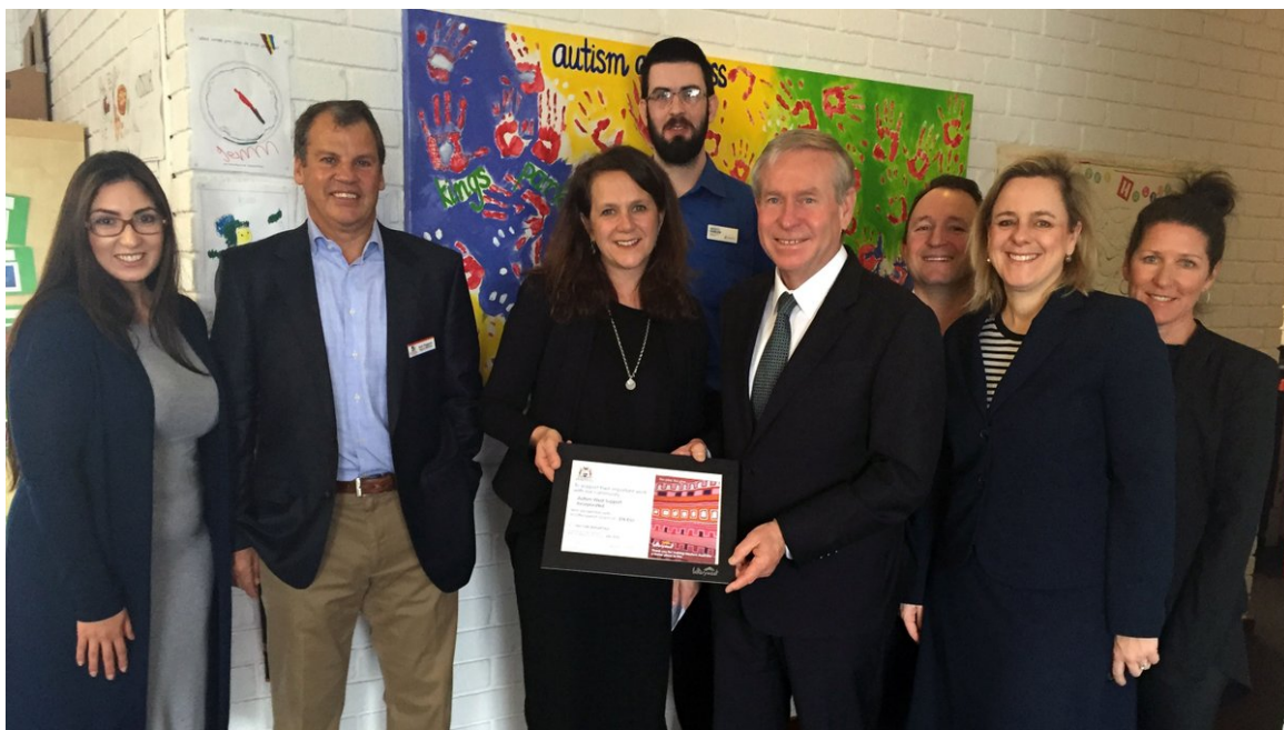
Premier Colin Barnett & the Autism West Team