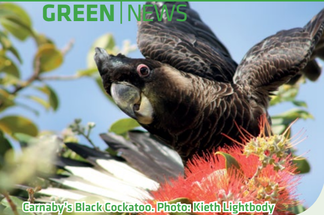
Carnaby's Black Cockatoo.