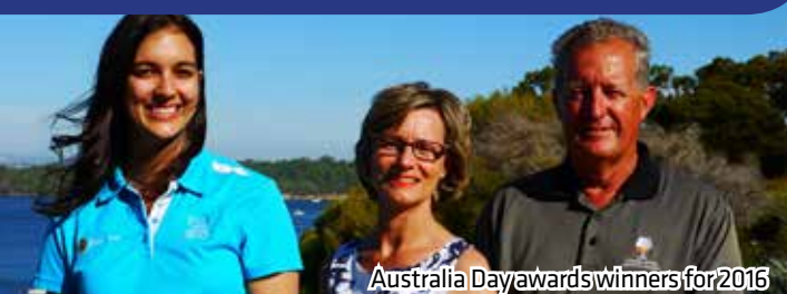
Australia Day awards winners for 2016