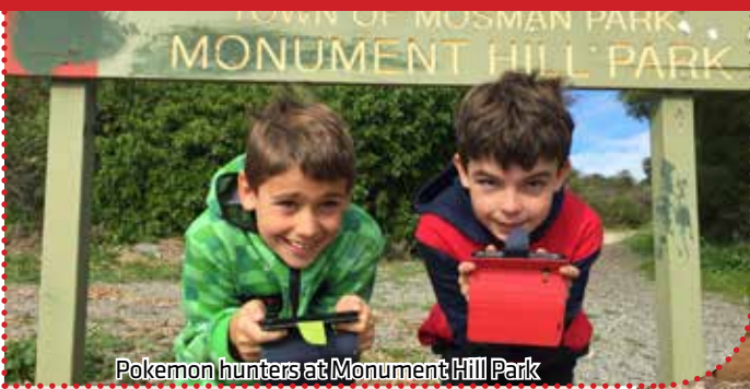
Pokemon hunters at Monument Hill Park