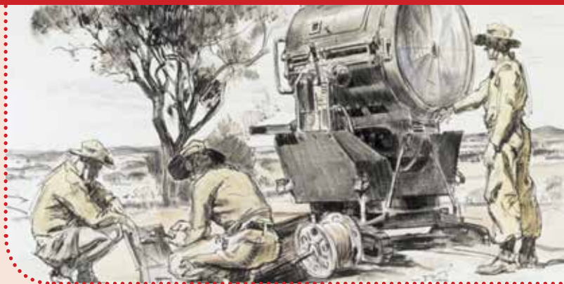
This drawing is indicative of the searchlight used in Mosman Park during WW2.