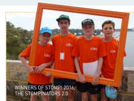
WINNERS OF STOMP! 2016, THE STOMPINATORS 2.0

For information on activities and times visit the website thegrovelibrary.net or call 9286 8686 .