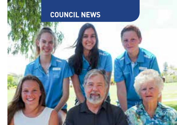
AUSTRALIA DAY AWARD RECIPIENTS FOR 2017

With a total pool of $10,000 available, grants up to $2,000 are on offer to support local not-for-profit groups to deliver programs, services and events to the Mosman Park community in a safe, efficient and sustainable way. Applications close midnight Thursday 12 October 2017. Application forms can be downloaded from the Town's website at