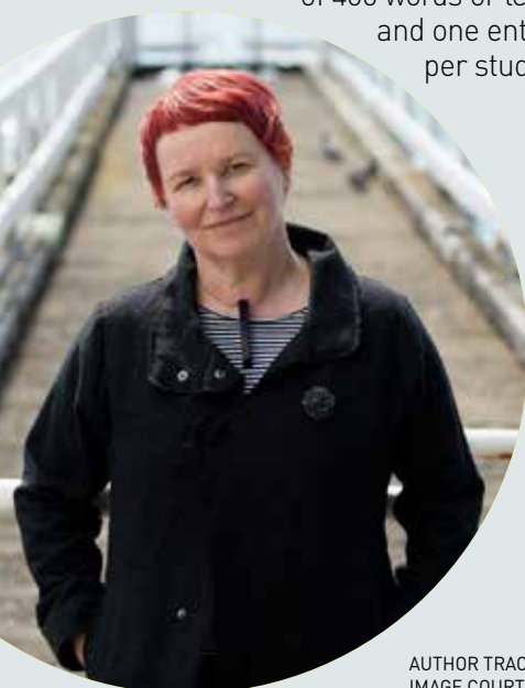
AUTHOR TRACY FARR

A great opportunity for all budding young writers. No story is too ordinary or astonishing, just put pen to paper and let your imagination run wild. Your story can be about anything, with a limit of 400 words or less and one entry per student.