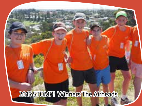
2015 STOMP! Winners The Airheads

Just like television's 'The Amazing Race', STOMP! will see teams of local young people aged 10 - 18 years travel by foot to various locations around Mosman Park where they will participate in exciting 'Checkpoint Challenges'. Groups may be comprised of 2 to 6 people and must be registered prior to the event. Checkpoint challenges will incorporate food, sport, art & craft, problem solving and environmental awareness so versatility and the willingness to have a go are a must. Groups and individuals welcome, but please note that any group with participants under 12 years must be accompanied by a supervising adult for the duration of the event.