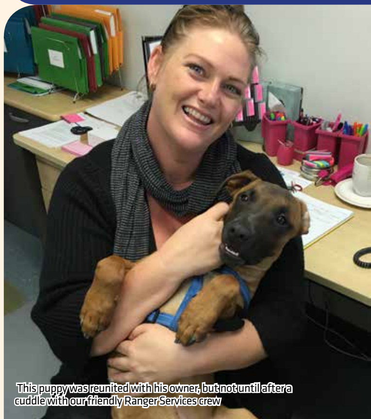
This puppy was reunited with his owner, but not until after a cuddle with our friendly Ranger Services crew