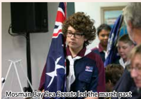
Mosman Bay Sea Scouts led the march past