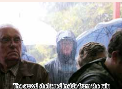
The crowd sheltered inside from the rain

Ms Bishop then spoke about the ongoing commemorations of the centenary of the ANZAC legend, with 2016 marking the 100th anniversary of the Battle of the Somme. She reinforced the importance in a contemporary context of the personal values forged by the ANZACs on the battlefield – mateship, tenacity, courage and perseverance. Following the service, hundreds of residents, friends and neighbours then stayed on to enjoy morning tea provided by the Town of Mosman Park, and to enjoy community fellowship, sharing family stories of war and sacrifice, and reflecting on the meaning of ANZAC Day. Lest We Forget.