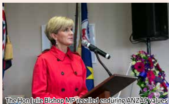
The Hon Julie Bishop MP recalled enduring ANZAC values