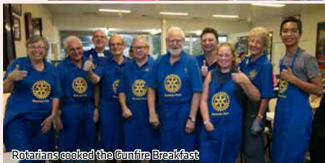
Rotarians cooked the Gunfire Breakfast

This publication and all other Town publications are available in alternative format on request. Whilst all care has been taken to provide accurate and current information at the time of production, the Town is not able to guarantee its accuracy. The information provided within the Town News is also available on the Town's website and will be updated on a regular basis: www.mosmanpark.wa.gov.au